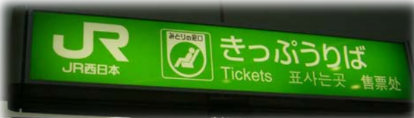
JR Ticket shop at the Kansai Int'l Airport.

Both HARUKA and Shinkansen are JR. Please purchase a ticket to Aioi at the JR ticket shop. The fare is 6,900 JPY. It is recommended to purchase return (round trip) tickets at this time.