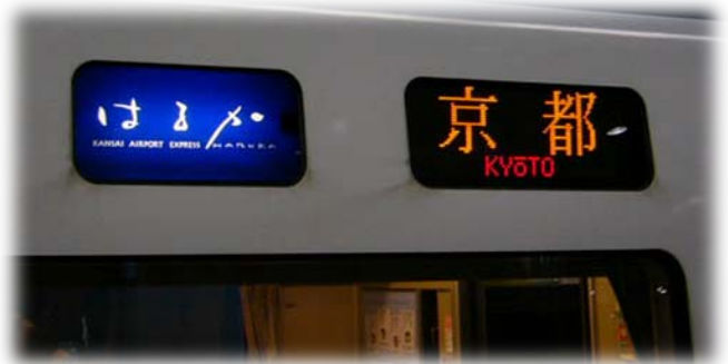
JR Airport Express "HARUKA" Bound for Kyoto 京都