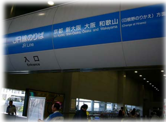
JR ticket gates

Both HARUKA and Shinkansen are JR. Please purchase a ticket to Aioi at the JR ticket shop. The fare is 6,900 JPY. It is recommended to purchase return (round trip) tickets at this time.